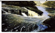
Andrew Wyeth 'The Carry' 2003 | Andrew wyeth.