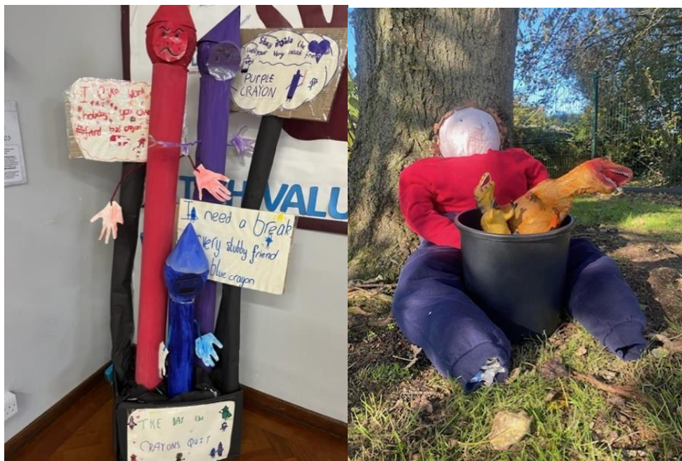
The Scarecrow Trail is a great example of the community spirit that is tangible in Carlton Village – well done to all who made, displayed and viewed the scarecrows.