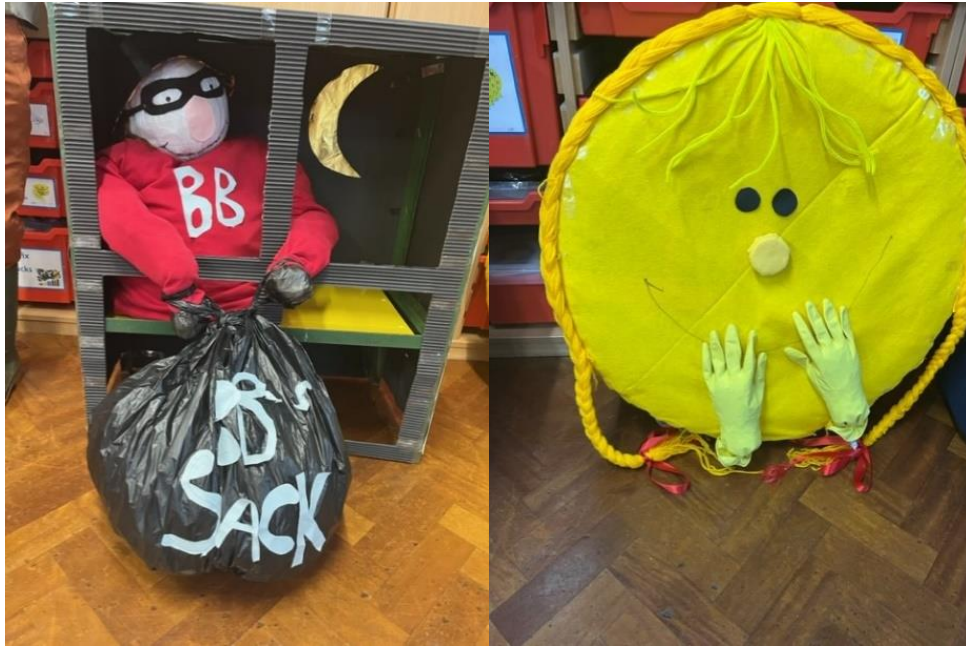
More scarecrows: 'Burglar Bill' (Y2), 'The Day the Crayons Quit' (Y5) 'Little Miss Sunshine' (Y1) and 'Harry and his Bucketful of Dinosaurs' (Carlton Owls).