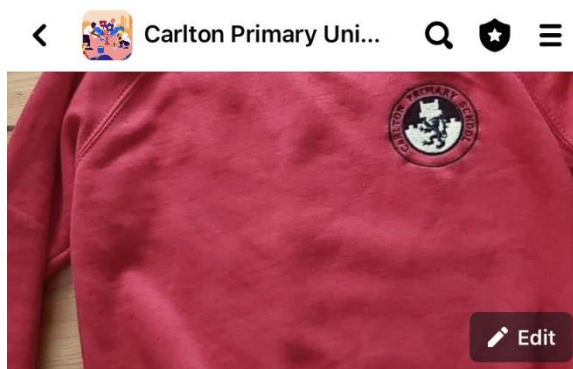
Carlton Primary Uniform Swap >

(6) Carlton Primary Uniform Swap | Facebook